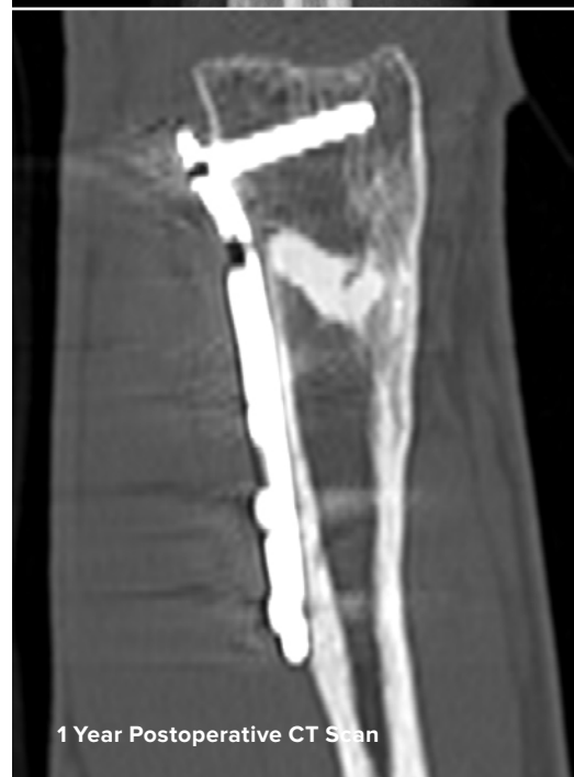
1 Year Postoperative CT Scan