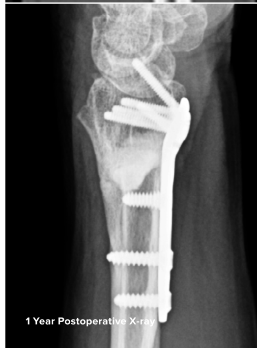
1 Year Postoperative X-ray