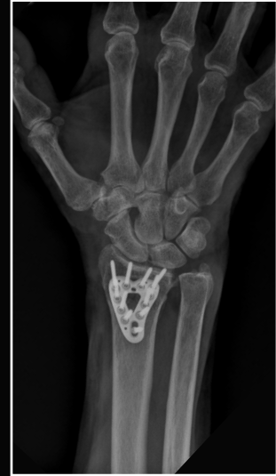
45 yo male – Interarticular distal radius fracture; radiocarpal subluxation Preoperative and Postoperative