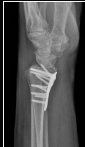
55 yo male – Complex intra-articular distal radius fracture Preoperative and Postoperative