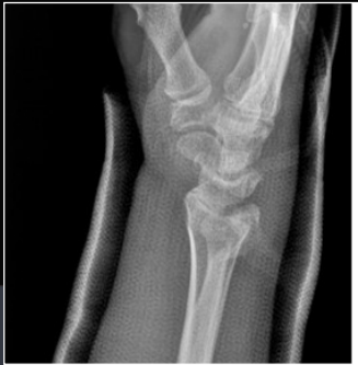
45 yo male – Interarticular distal radius fracture Preoperative and Postoperative