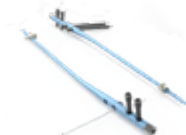
Fibula Nail 2 System